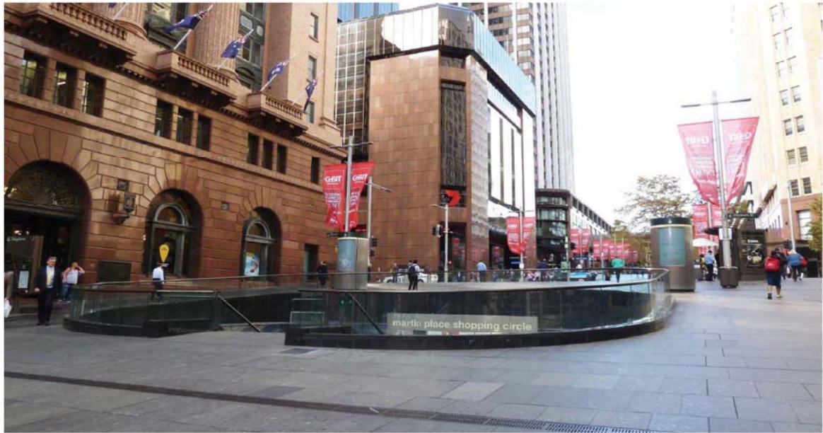
Looking East from Castlereagh to Elizabeth Street